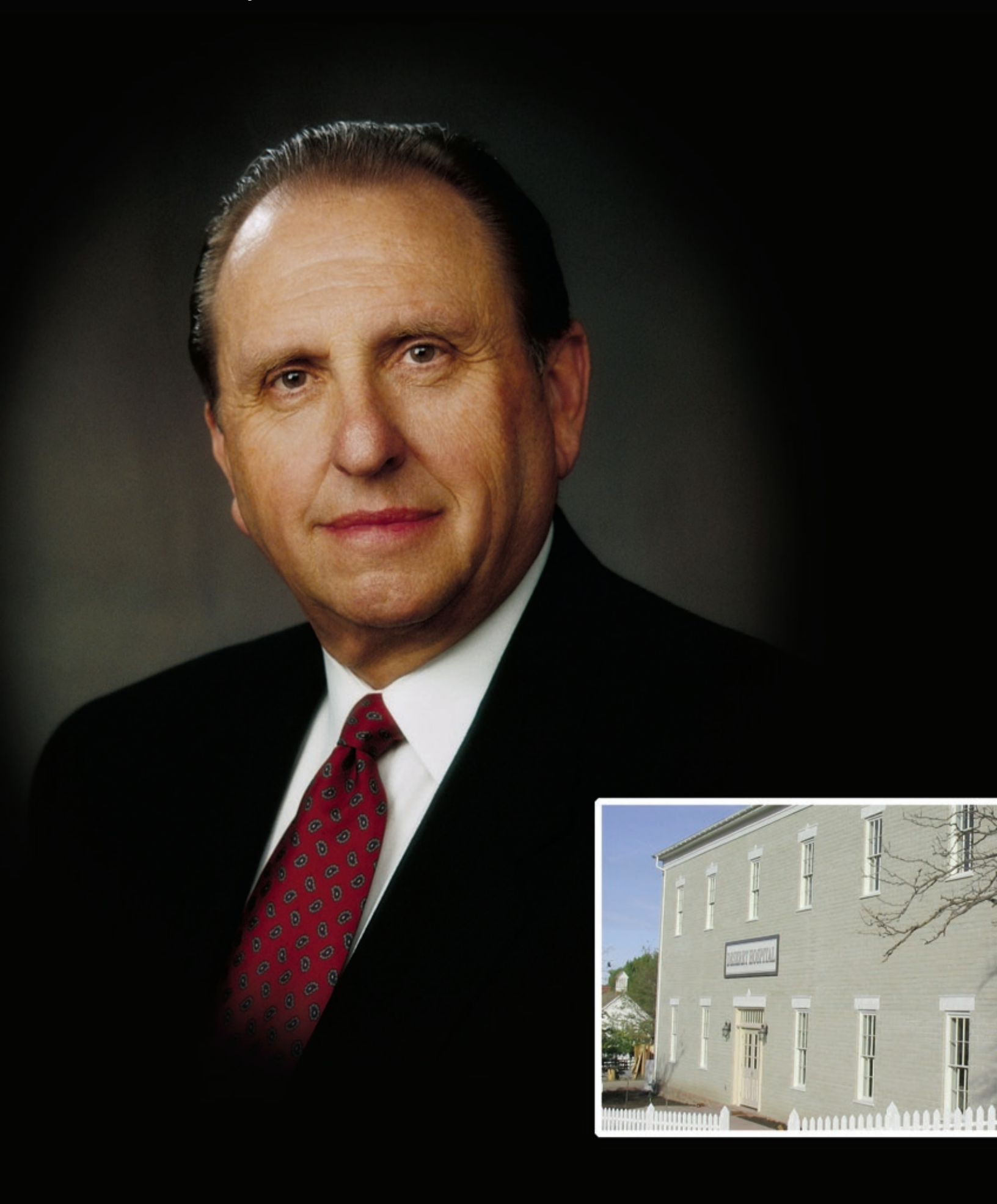
THE JOURNAL OF COLLEGIUM AESCULAPIUM