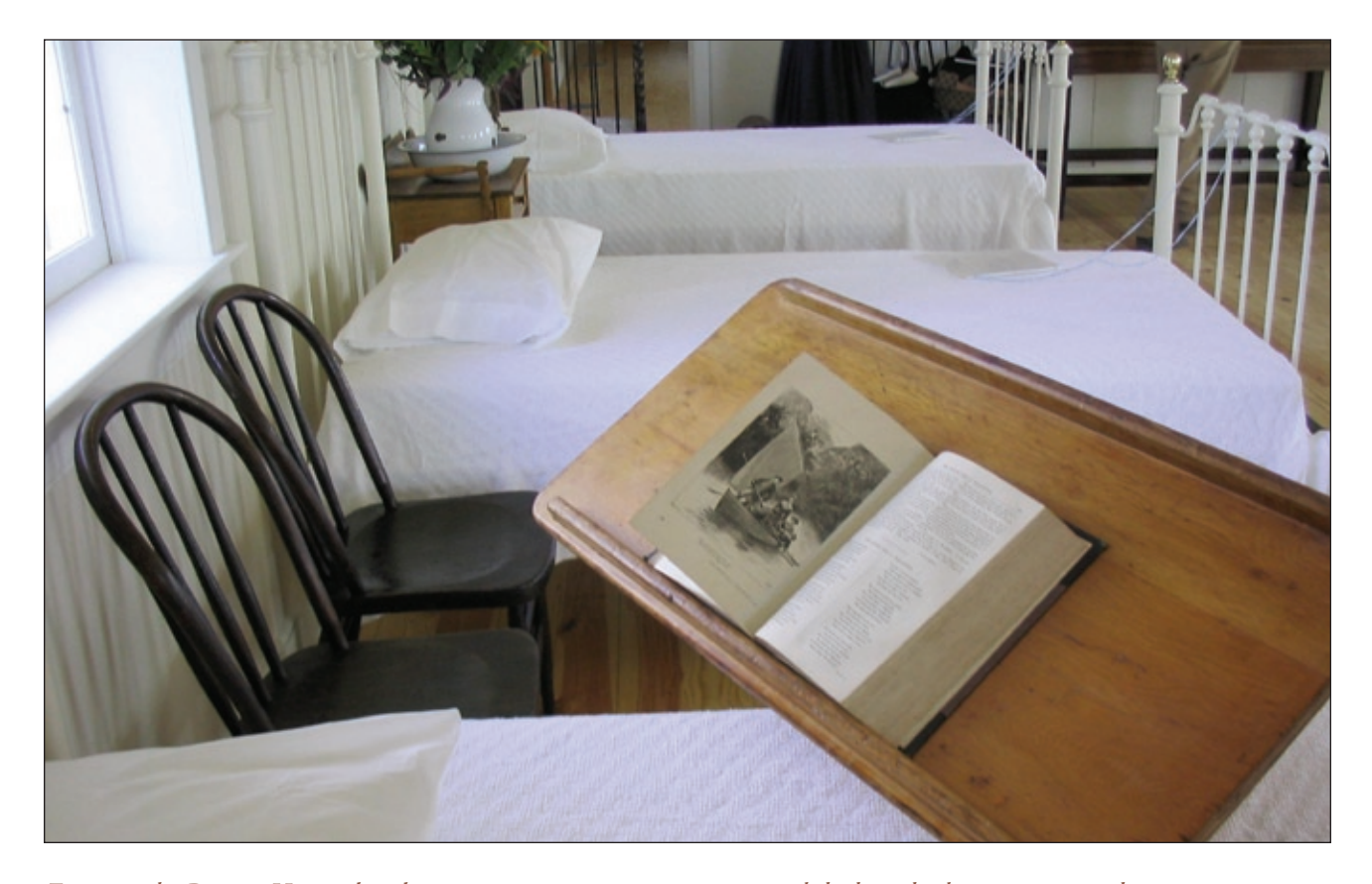
Entering the Deseret Hospital replication, visitors see an open room with beds and other 1870s period furnishings.

For several years she underwrote the services in their entirety with personal funds. In hopes to compensate for the absence of reliable roads or transportation, the service featured nurses on horseback that were able to reach the most remote areas in all kinds of weather.